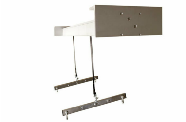
Electric Lift 170 Heavy Duty