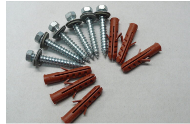
Fixing for brick or concrete