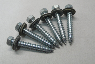
Fixing for wood