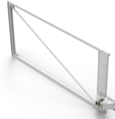
Gate 3 panels