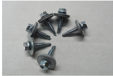
Fixing for steel