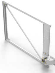
Gate 2 panels