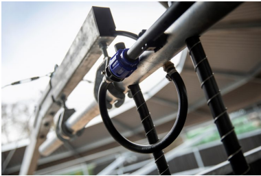
Track irrigation Sublime