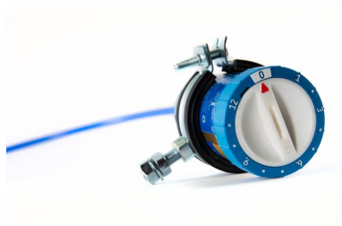
Lubrication system 12 months