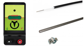
Shock device set Basic 230