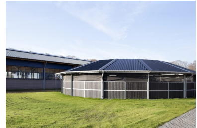
Passage 18 meters 750N