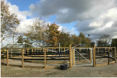
Basic XL fencing 18,6 mtr