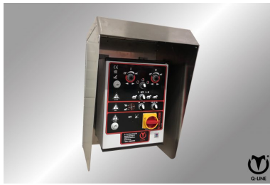
Control box cover