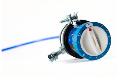
Lubrication system 12 months